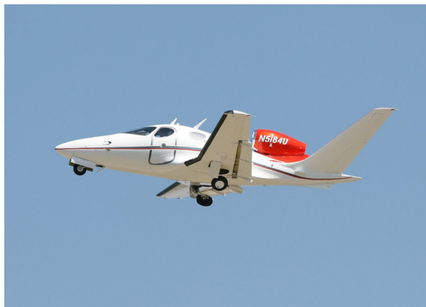
Figure 2.6 The motion of this Eclipse Concept jet can be described in terms of the distance it has traveled (a scalar quantity) or its displacement in a specific direction (a vector quantity). In order to specify the direction of motion, its displacement must be described based on a coordinate system. In this case, it may be convenient to choose motion toward the left as positive motion (it is the forward direction for the plane), although in many cases, the x -coordinate runs from left to right, with motion to the right as positive and motion to the left as negative.

What is the difference between distance and displacement? Whereas displacement is defined by both direction and magnitude, distance is defined only by magnitude. Displacement is an example of a vector quantity. Distance is an example of a scalar quantity. A vector is any quantity with both magnitude and direction . Other examples of vectors include a velocity of 90 km/h east and a force of 500 newtons straight down.