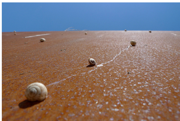
Figure 2.8 The motion of these racing snails can be described by their speeds and their velocities.

There is more to motion than distance and displacement. Questions such as, “How long does a foot race take?” and “What was the runner's speed?” cannot be answered without an understanding of other concepts. In this section we add definitions of time, velocity, and speed to expand our description of motion.